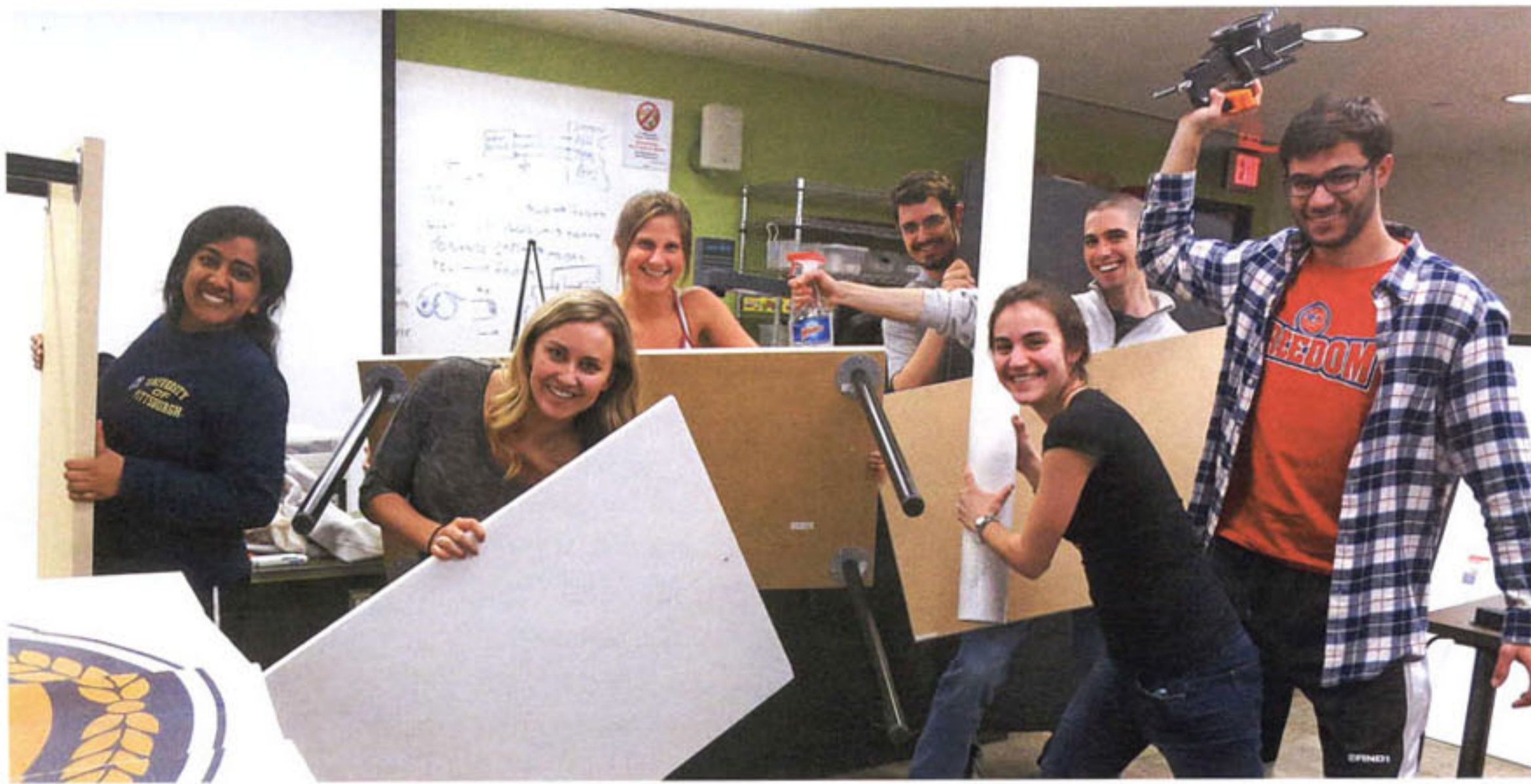
At the University of Pittsburgh, students helped design the curriculum and a “makerspace” classroom for the hands-on learning course “The Art of Making”

faculty or staff, and no rules about what students can do there.